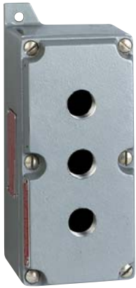
Style 1 - GCS-16