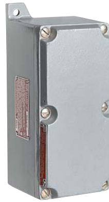
Style 3 - SWBC-16

Class I, Div. 1 & 2, Groups C,D Class I, Zones 1 & 2, Groups IIB, IIA Class II, Div. 1 & 2, Groups E,F,G Class III NEMA 7(C,D) 9(E,F,G) SWBC Series: