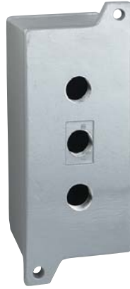
Style 2 - GCS-163